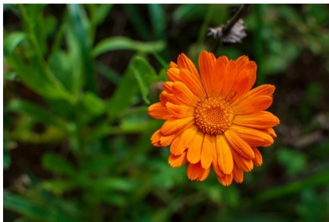
Figure 1. Calendula officinalis (photo taken from https://unsplash.com/ )